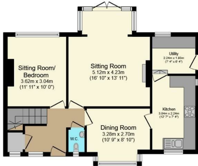
Ground Floor Floor area 63.0 sq.m. (678 sq.ft.)